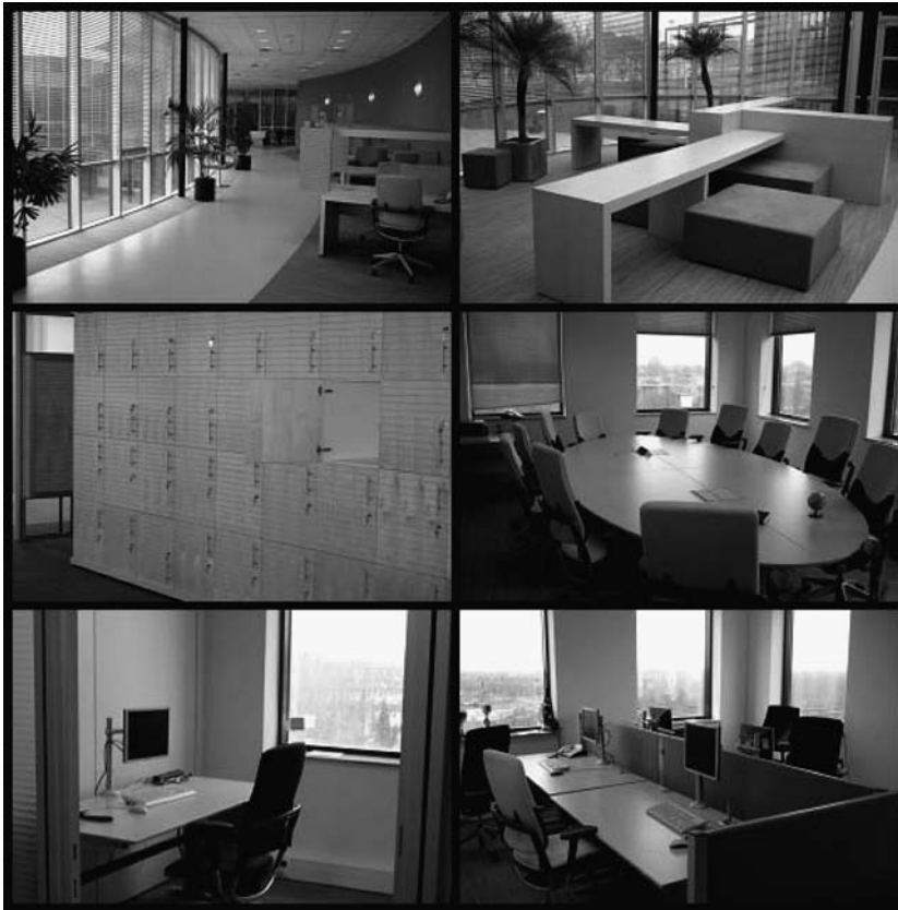
Plate 1. Impression of the design at organization X

many years. Second, by losing that own workplace they also lost the ability to personalize their space. Third, they had to get used to clean desk behavior, which meant that they have to leave the desk they used behind they way they found it: clean and empty. This way other employees could use the desk as well.