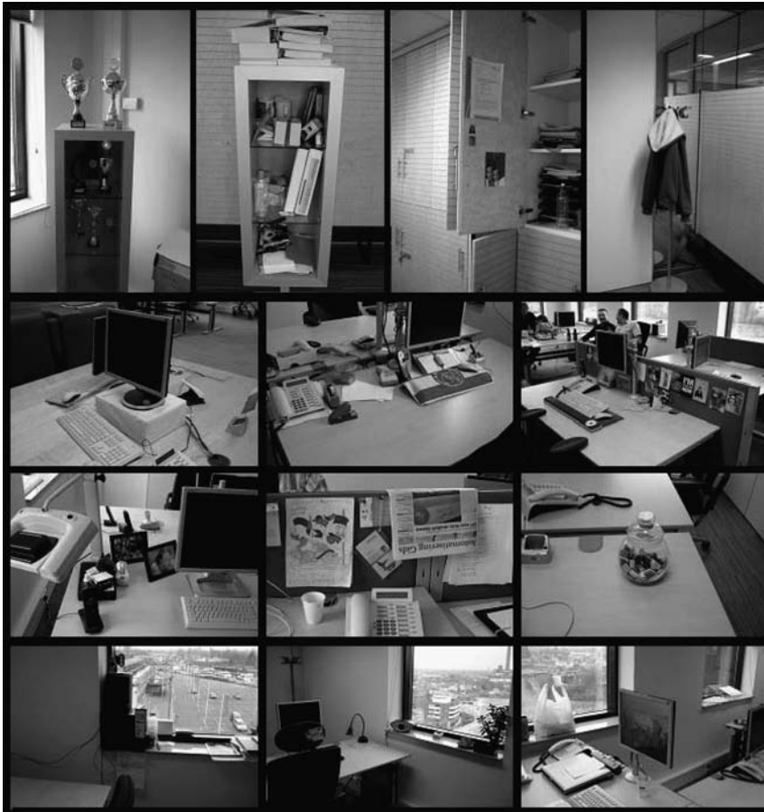
Plate 2. Individual personalization with items

A fifth distinction can be made in personal and work-related personalization. Most items were personal and said something about the owner. But, for example, adjustments to desks or the spreading of paperwork around the workplace were work-related. A sixth and last way of personalization noticed was a more mental way of personalization through social contacts, to make the environment comfortable and familiar.