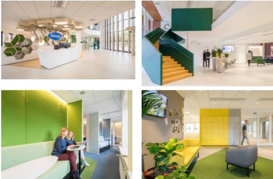
Figure 2. Menzis Building in Enschede, the Netherlands