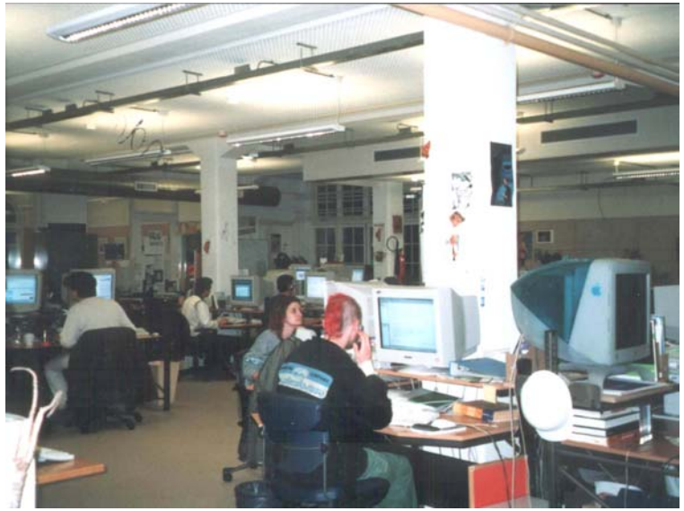
Figure 4: NetlinQ