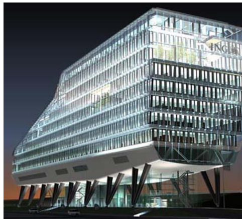
Figure 3: Two bank buildings: same function, same location (the South of Amsterdam, the Netherlands), built within the same period, but with a very different appearance and layout. a) ABN AMRO Bank, designed by Henry N. Cob and opened in 1999 b) ING Bank, designed by Meyer and Van Schooten and to be opened in 2002