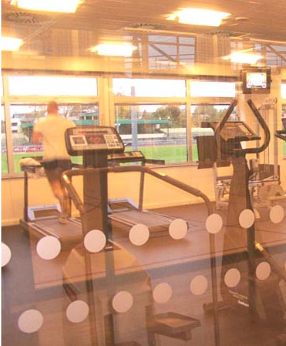
Figure 1 Gym at the Nike European Headquarters (Hilversum, the Netherlands), designed by William McDonough (US)