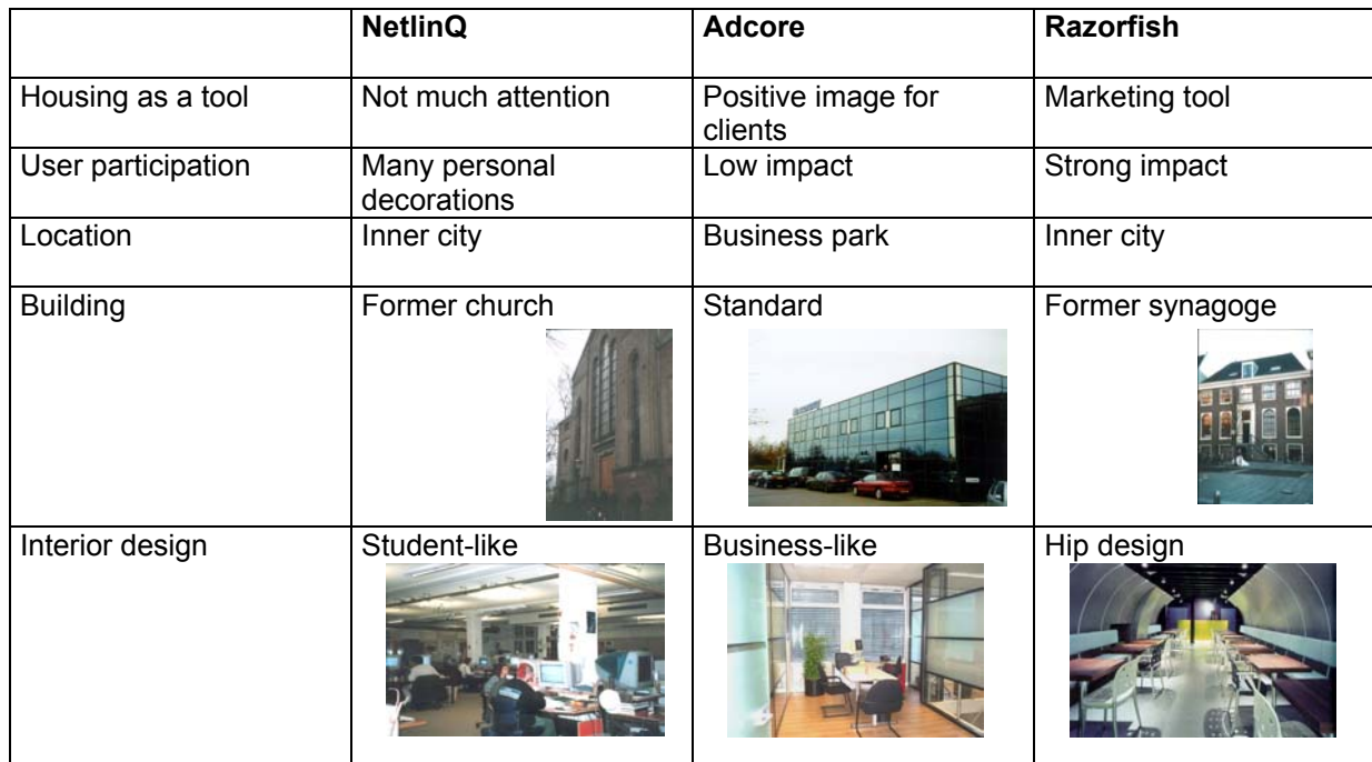
Figure 8: Accommodation characteristics of the three cases