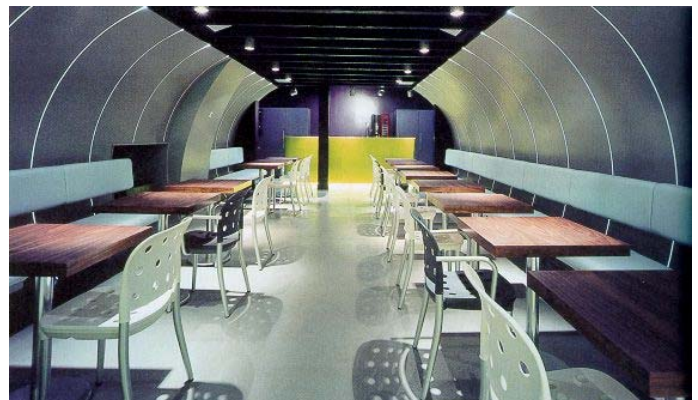
Figure 6: Razorfish